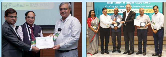
Presentation of Certificate of participation to the author during 83rd STAI Annual Convention 2025

Keeping in view the significance of the event and the limited number of technical papers will be accepted and presented during the convention, the authors are requested to write quality papers, giving their latest innovations, enclosing the precise data with the achievements of their research work and its usefulness to the sugar industry. The last date for submission of soft copy of the paper is 09th June 2026. Detailed guidelines can be accessed from STAI website : www.staionline.org