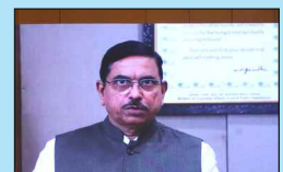
Mr. Prahlad Joshi Hon'ble Union Minister of Consumer Affairs, Food and Public Distribution, Government of India