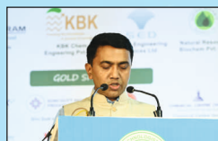
Dr. Pramod Sawant Hon'ble Chief Minister of Goa