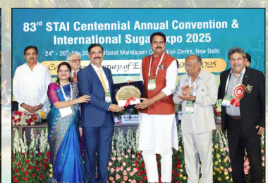
Snapshots of the award presentation ceremony during STAI Annual Convention 2025