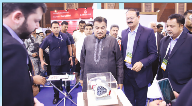
Snapshot of the International Sugar Expo 2025