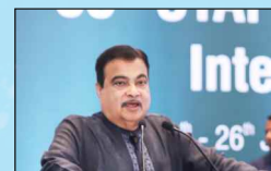
Mr. Nitin Gadkari, Hon'ble Union Minister of Road Transport and Highways, Government of India